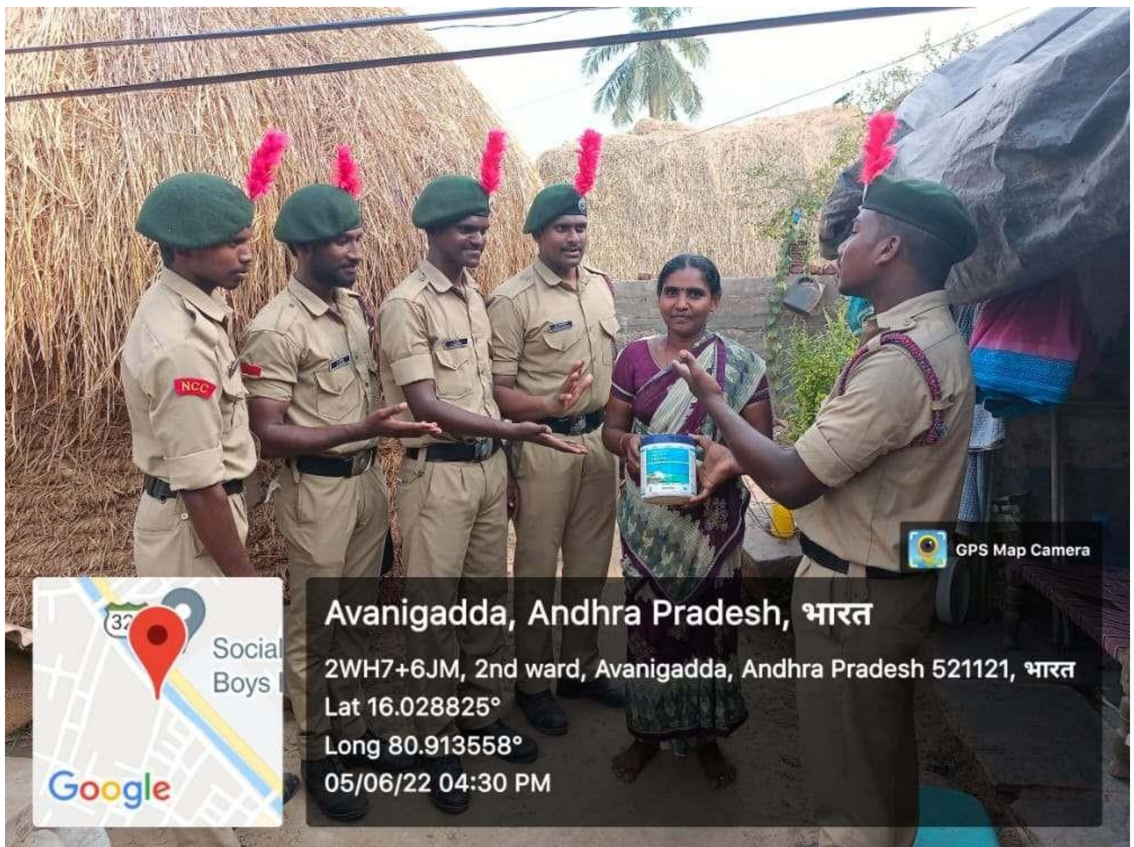
Awareness programme on Organic Manure and Soil Pollution